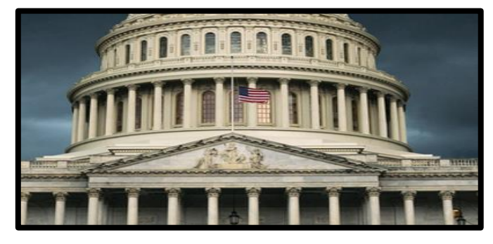
3. Congressional Inquiry