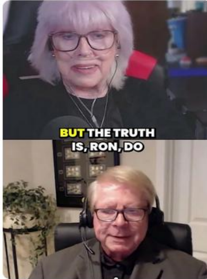
Why Target Date Funds : could devastate ...

https://www.youtube.com/shorts/i7J6bHFbR1Q