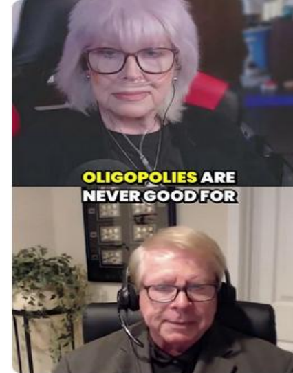
The Hidden Truth About : Target-Date Funds: Th...